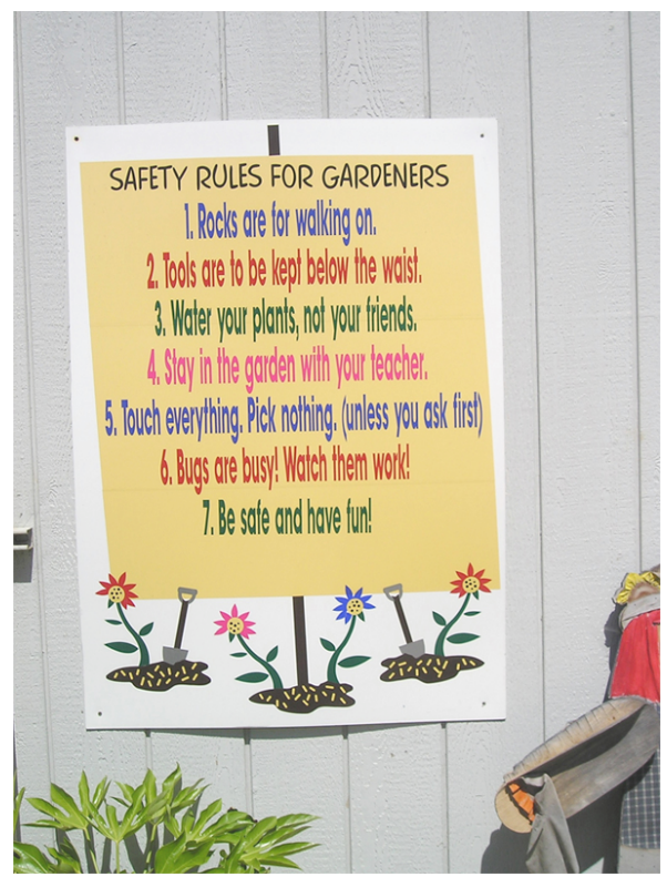
A colorful poster in the garden will remind students of the safety and/or etiquette rules.