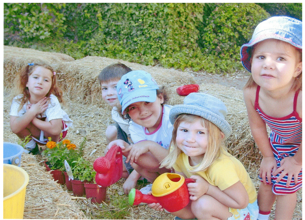
If children are watering with a hose or watering cans, it may be necessary to follow up with periodic deep watering.